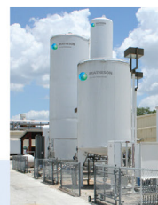
Onsite & Pipeline Plants