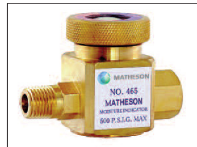
Model 465 Moisture & Impurity Indicator