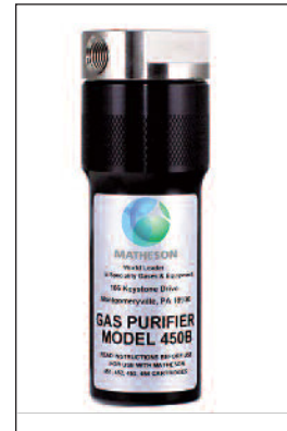
Model 450B High Pressure / Low Capacity Gas Purifier