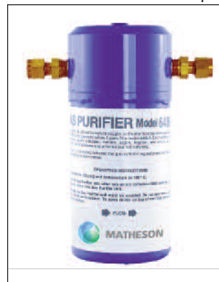
Model 6406 Oxygen Removing Inert Gas Purifier