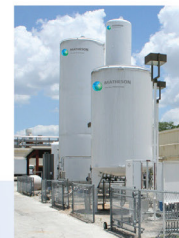
Onsite Plants and Pipeline