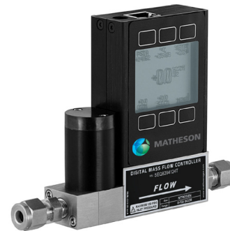
829 Series Mass Flow Controller