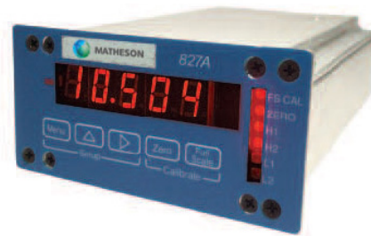
827A Single Channel Controller / Monitor