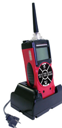
Model GX-2003 Multigas Leak Detector