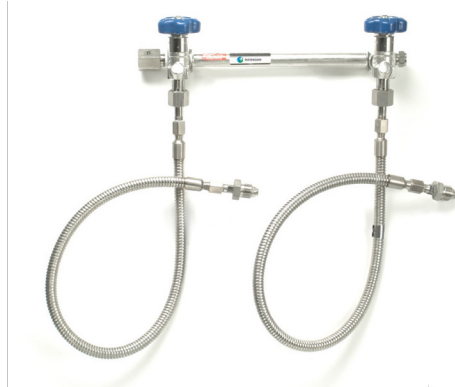
Model 53 Single Station Manifolds