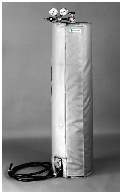
Model HQ2015 Therma-Cal Gas Cylinder Blanket