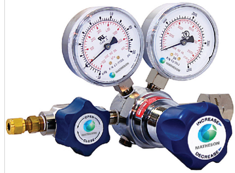
Model 3537-350 Regulator

Note: For indoor temperature greater than 50° F (10° C)