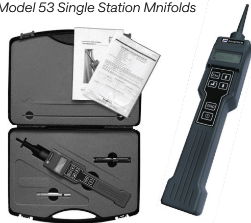
Model 8067 Multigas Leak Detector