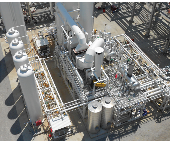
Nippon Sanso Matheson Hydrogen Plant at Refinery Customer

With our Total Solution approach, we work with your plant experts to design the customized package that addresses your specific requirements.