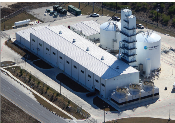
Nippon Sanso Matheson Air Separation Unit, San Antonio, TX