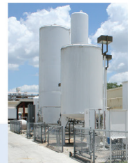
Onsite & Pipeline Plants